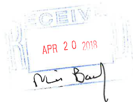
Dale Copeland, Mayor City of Bartlesville

A handwritten signature in blue ink that reads 'Dale Copeland'.