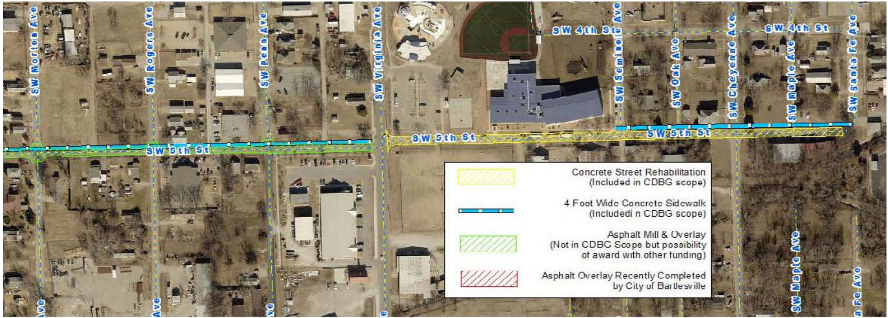
EXHIBIT C Proposed Location of 5 th Street Improvement Project